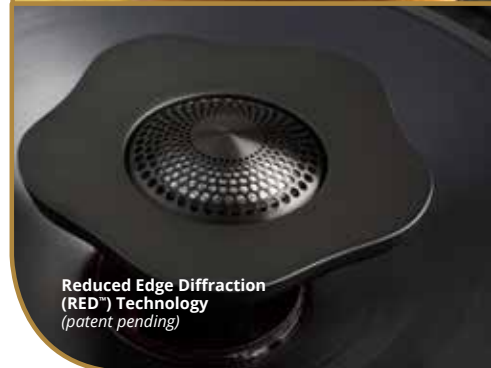
Reduced Edge Diffraction (RED™) Technology (patent pending)