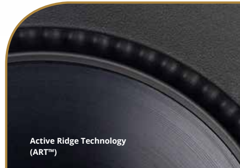
Active Ridge Technology (ART™)

NEW Rear Component Shielding protects internal parts from debris. The polycarbonate material creates an installation that will not warp. Flat covers also make it easy to lie speakers down during the installation process without tipping.