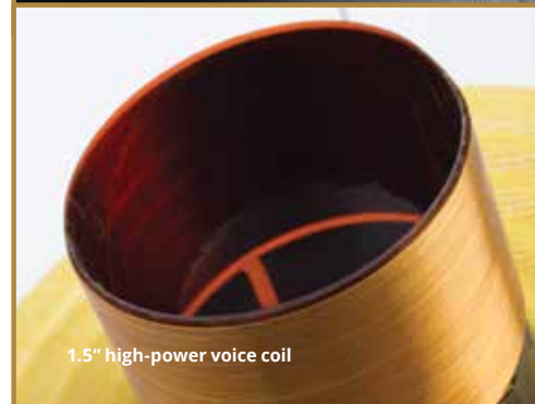
1.5" high-power voice coil